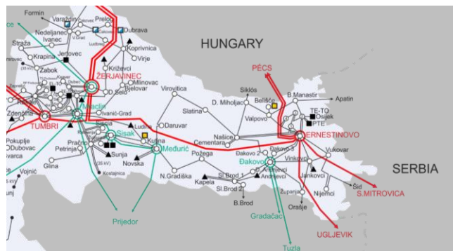
Figure 1, relevant part of the Croatian grid, source http://www.hops.hr/

As described in the online Transformers Magazine a regional black out occurred on May 14 th , 2014, about 9 a.m. The article states: “The entire city of Osijek, a large part of Slavonija and almost the whole of Baranja lost power supply,” and further “At about 10 a.m., the power supply to all areas was re-established, according to Nada Kolega, a spokeswoman for Croatian Transmission Utility (HOPS).”